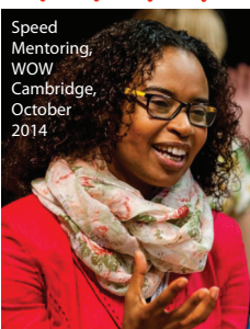
Speed Mentoring, WOW Cambridge, October 2014