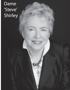
Dame 'Steve' Shirley